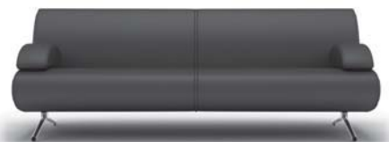
RETRO FLAIR Sleek Design

Geometric lines suspend soft orbs for a style that wows at first sight. From mid-century modern living spaces to contemporary kitchens to minimalistic dining rooms – Aura’s asymmetrical grid adds balance and interest to a variety of decors.