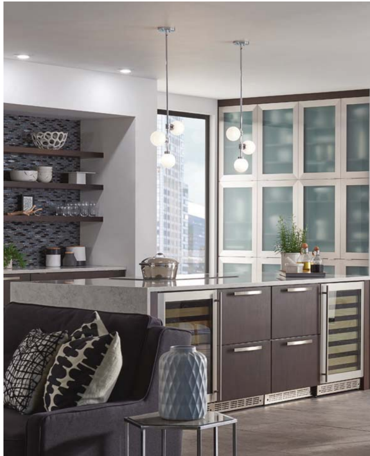
Aura Pendant 44095 CH | Page 149